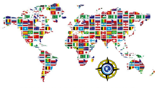
STUDENTS FOR GLOBAL HEALTH UC San Diego